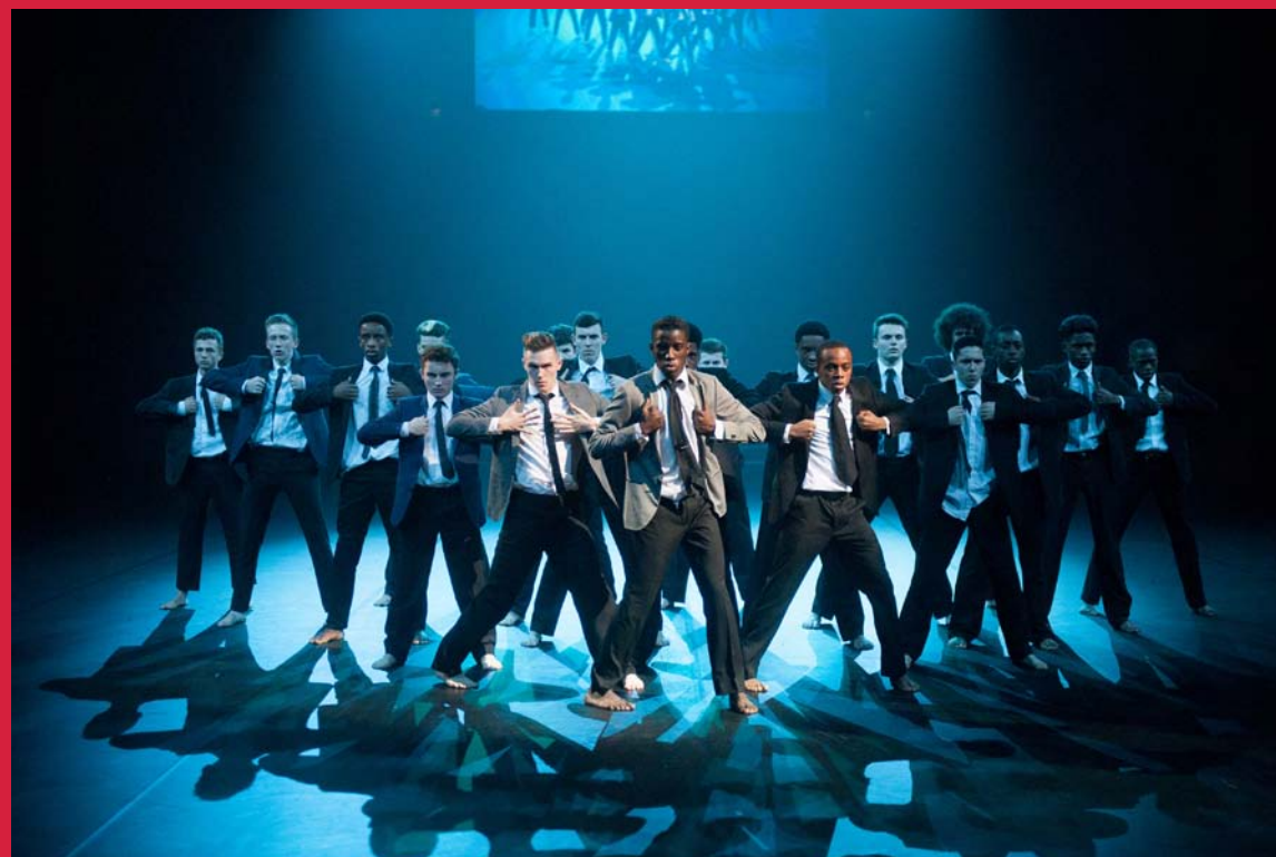
Dance Proms 2013.

Dance Proms is a unique and exciting celebration of dance and the gala performance at the Royal Albert Hall gives young dancers from all over the world the perfect place to showcase their talents and creativity.