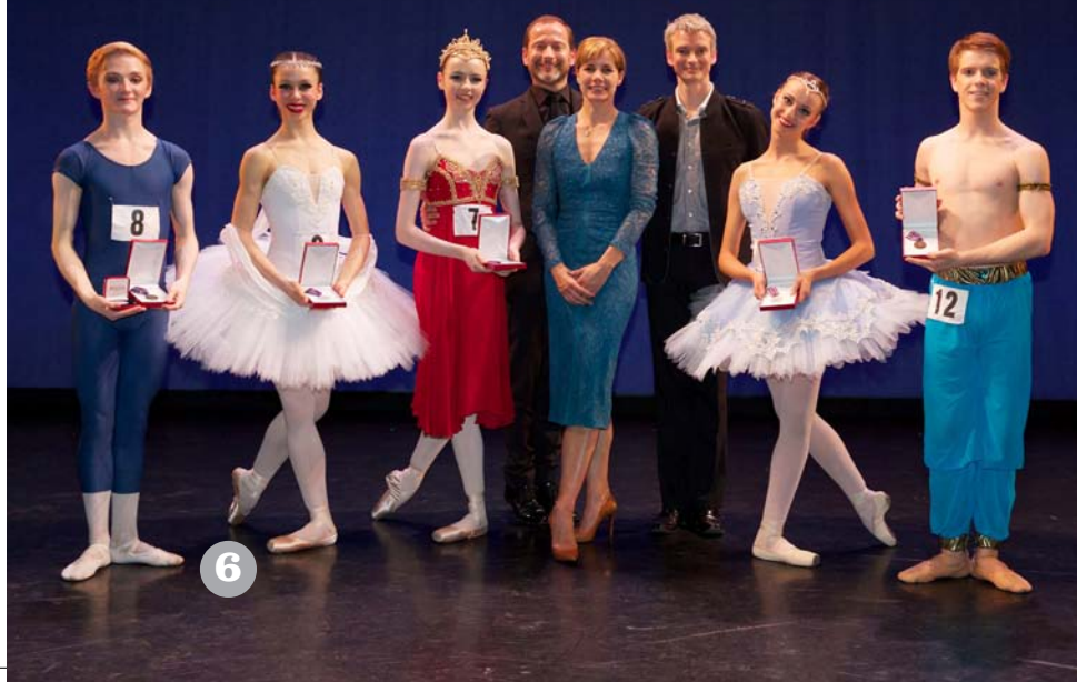
Darcey Bussell with the 2013 medal winners