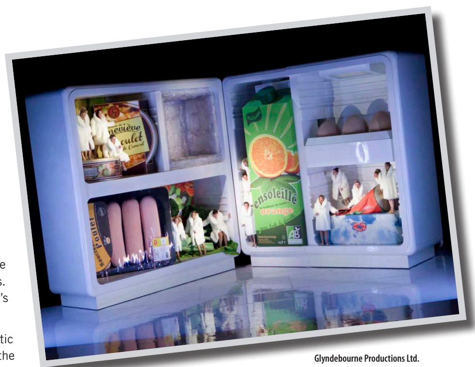
Glyndebourne Productions Ltd. Photo Bill Cooper

Founded in 1934, Glyndebourne is committed to delivering the highest standards of operatic performance, commissioning new work, developing new talent and reaching new audiences. In the 1,200 seat opera house, the festival featured performances of five other operatic productions by Mozart, Strauss, Verdi, Britten and Donizetti.