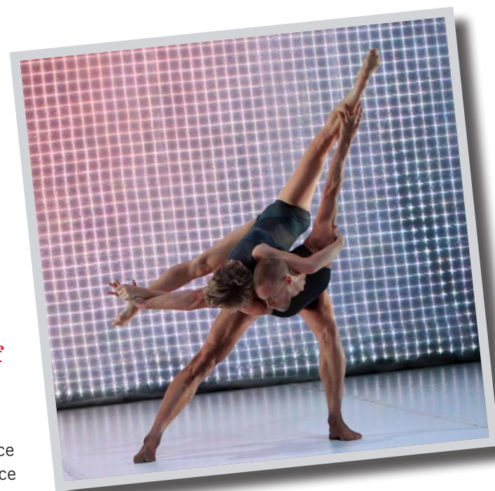
2 One Another – Sydney Dance Company

Held on August 5th 2013, the Australian Dance Awards sponsored by Harlequin Floors proved a huge success for the internationally acclaimed Sydney Dance Company when its '2 One Another' work scooped a hat-trick of prizes.